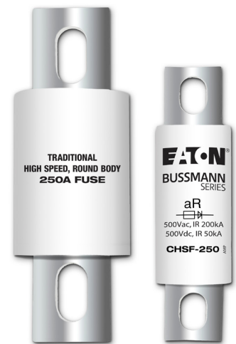
Bussmann series compact high speed fuse compared to a traditional high speed, round body fuse.